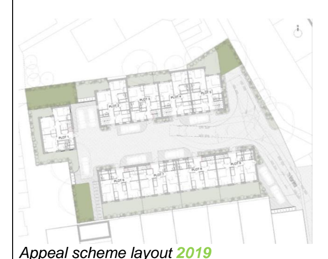
Figure 1 is amended as follows to reflect the previous appeal site layout.

The proposed layout is broadly the identical to as the previous scheme under ref: P/0089/20, where the gap between building labelled Plot 1 and Plot 3 are increased with the omission of plot 2 and the proposed building footprint of Plot 1 has been increased with the addition of plot 2 with the building abutting the western side boundary from the 2019 scheme under planning ref: P/0898/19. The proposed building accommodating Plots 1 and 2 also maintains a similar set back from the northern boundary as the block accommodating Plots 3-5. The Therefore the layout is considered appropriate and it would be unreasonable to warrant a refusal on the basis of the Inspector's decision.