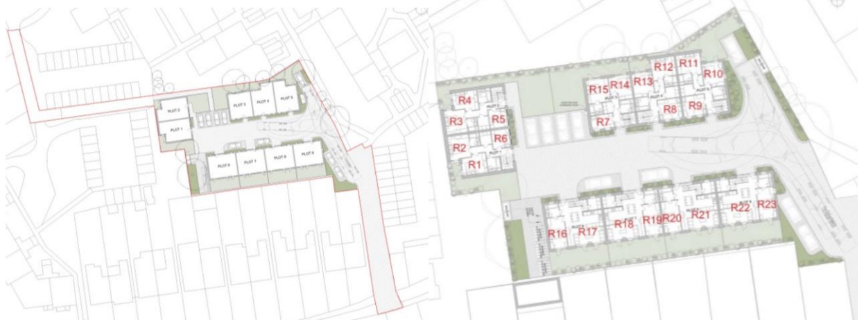
Appeal Scheme layout 2020