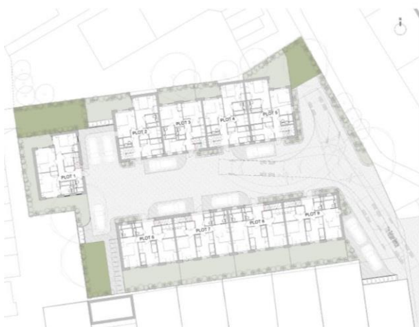
Appeal scheme layout 2019

Figure 1 is amended as follows to reflect the previous appeal site layout.