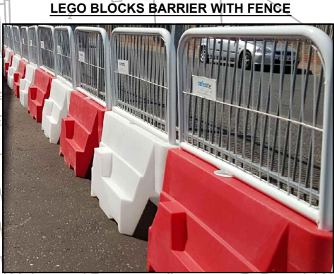
LEGO BLOCKS BARRIER WITH FENCE