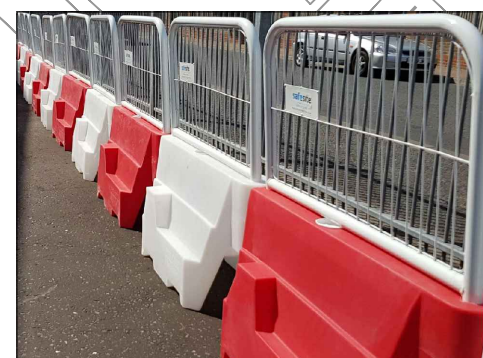
LEGO BLOCKS BARRIER WITH FENCE

Acad file Location C:\Harrow Traffic Scheme 2020\Transition programme\TPR0240_PSD\DWG\PS_Proposed Layout.dwg